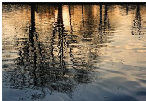
Winter Sunset Reflection by Philip Byford