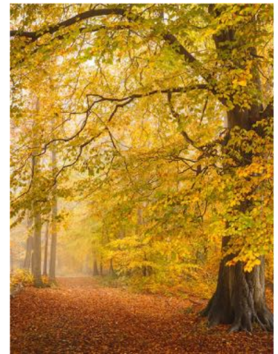
Soft Light In Autumn by Jim Turner