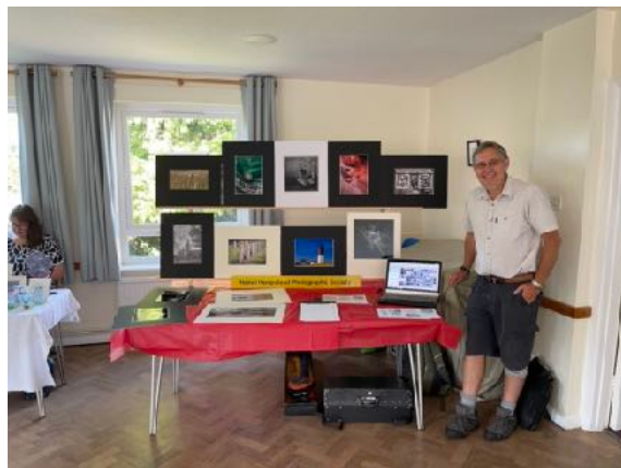
The stall at St. Marys Church Hall