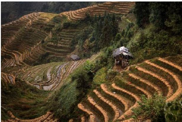
Original Colour Image

For the original colour image below I adjusted exposure and contrast in Lightroom and used some dodging and burning to mould the lighter and darker areas for a more 3D effect. I also increased the saturation of the oranges and greens to counteract the dull, flat light. In converting it to black and white I thought it would work better if the focus was on the nearest terrace so created an exaggerated vignette using a combination of linear and radial masks in Lightroom and cropped the top part of the frame. I also used luminosity masks in Photoshop to pick out and emphasise the highlights on the terraces and darkened the shadows for more contrast.