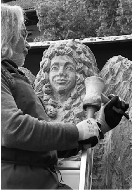
'Watching a master at Work' by Clare Long