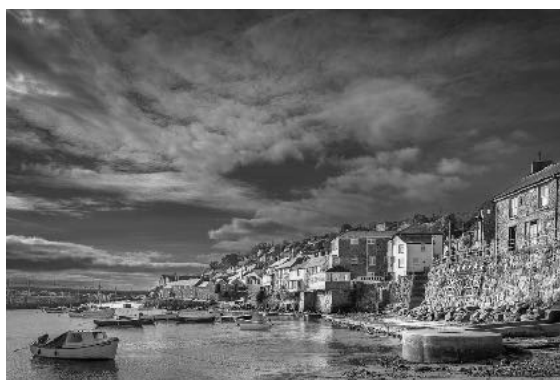
1st Black and White Image

I first used Lightroom's Landscape feature, which creates individual masks for the sky, water and vegetation, and made adjustments to each without affecting the other elements. After converting it to black and white I decreased the contrast in the lighter areas so they weren't too glaring. The first black and white conversion was really just a straight monochrome version of the colour image.