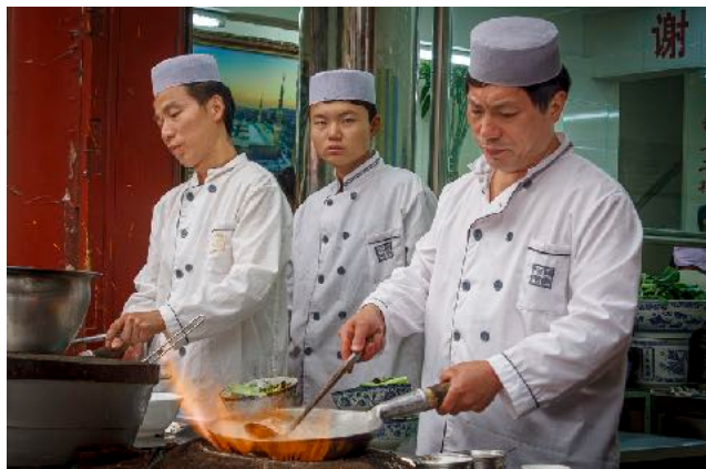
'Fast Food' by Jim Turner

One of many food stalls/cafés in Xi'an's Muslim Quarter. You can either have the food cooked in front of you to take away, or take a seat inside and have it brought to you. Watching Chinese chefs cook on a wok is fascinating and I watched them transfixed before deciding to take a photograph.