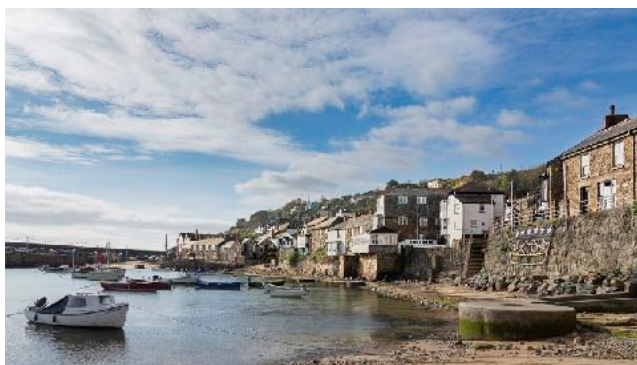
Original Colour Image

It was taken on a Canon 5D mark iii with a Sigma 24mm-105mm lens at 24mm focal length. Exposure was 1/200sec, f/8, ISO 100.