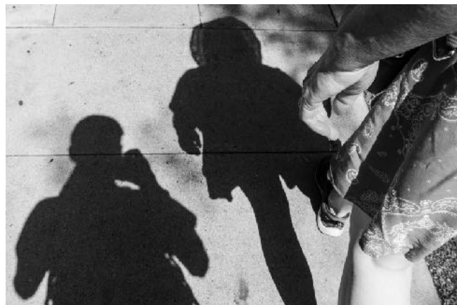
'Side by Side' by Roger Hudson