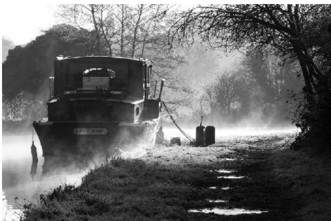
'Early Morning on the Grand Union Canal' By Roger Hudson

A selection of other images from this month's competitions