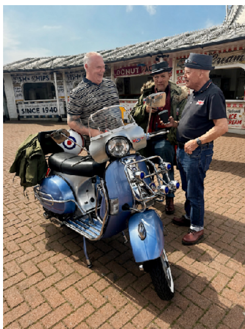
'Scooter Stories' by Clare Long

On Bank Holiday Monday, Brighton Pier was lined with classic scooters as local Mods gathered to catch up and show off their bikes. While plenty of people were happy to pose for a quick portrait, I wanted to get something a bit more natural. After chatting with this group for a while, I asked them to just carry on with their conversation and ignore the lens.